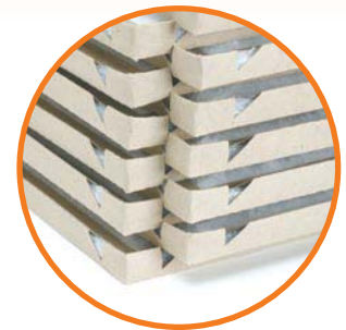
Pinch Frame Design