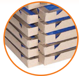
Notched Frame Design