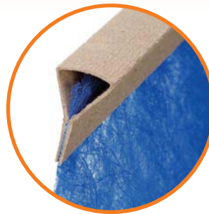
Pinch Frame Design